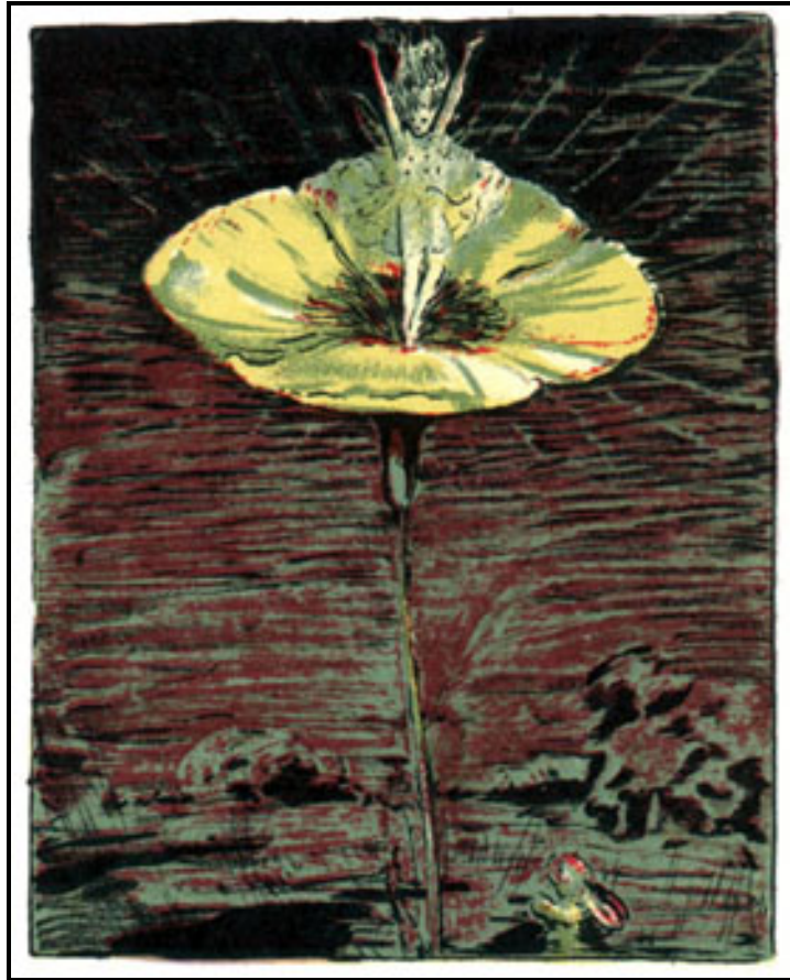
The Fairy Flower

"You were Real to the Boy," the Fairy said, "because he loved you. Now you shall be Real to every one."